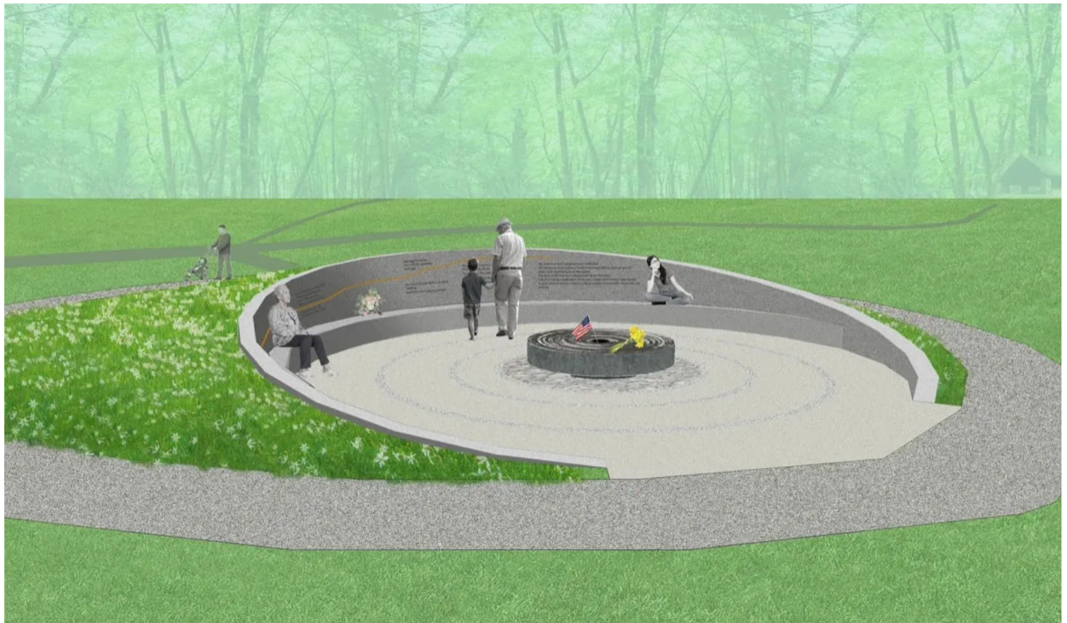
A rendering shows the planned COVID-19 art memorial at Lake Roland Park.

Baltimore County is moving forward with a public art memorial to honor the lives lost to COVID-19 and honor all those affected by the virus.