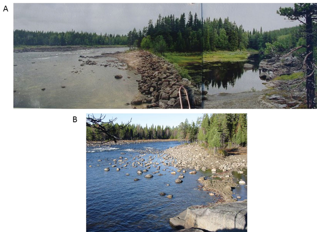
Figure 1. Example of river restoration along the Vindel River in Sweden. (a) Originally modified to disconnect overbank areas and secondary channels during floating of cut timber downstream, (b) the Vindel is now being restored through removal of bank structures such as the stone wall.

meandering channel with relatively open riparian woodland [Kondolf, 2006]. Recreationally driven river restoration dates to early 19th century instream structures designed to improve trout fishing [Van Cleef, 1885; Hubbs et al., 1932; Thompson and Stull, 2002; Thompson, 2006, 2013].