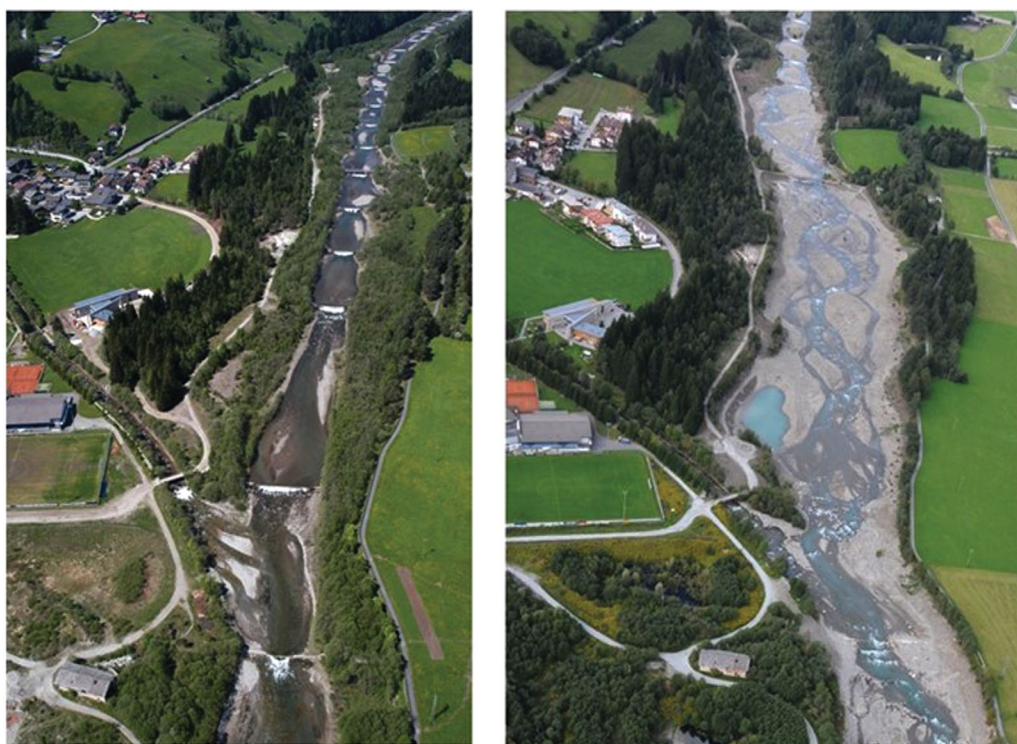
Figure 3. Example of river restoration through removal of grade-control structures along the Mareit River, Italy. View on the left is from 2005, prior to restoration. View on the right is from 2010, after restoration.

have been timed to take advantage of tributary sediment inputs [e.g., Melis , 2011; Mueller et al. , 2014]. Sediment deficits downstream of dams have also been addressed by gravel augmentation, including on the Rhine River, where annual coarse-sediment additions are oriented toward protecting downstream infrastructure, and elsewhere in Europe, Japan, and the US, where the focus of such efforts is most commonly on fish habitat restoration [Kondolf et al., 2014]. Bypassing sediment around dams via a range of engineering approaches represents a promising yet rarely implemented method of maintaining downstream sediment regimes [Kondolf et al., 2014].