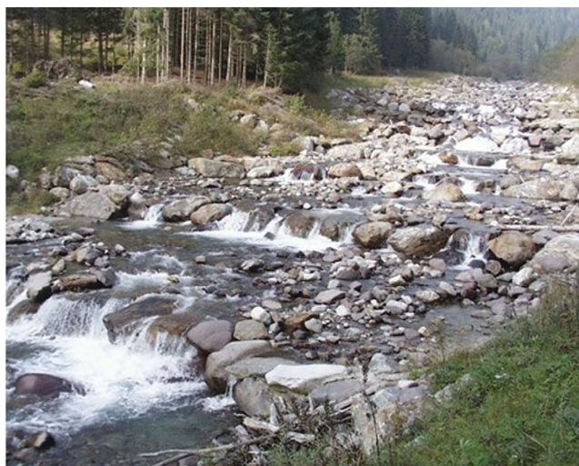
Figure 2. Example of restored step-pool sequence, here along the Maso di Spinele River in Italy.

2008], and manipulating flow and channel form to enhance uptake, storage, or transfer of diverse forms of pollutants.